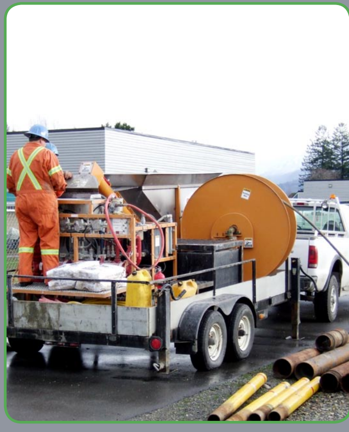
Grouting of gen loop