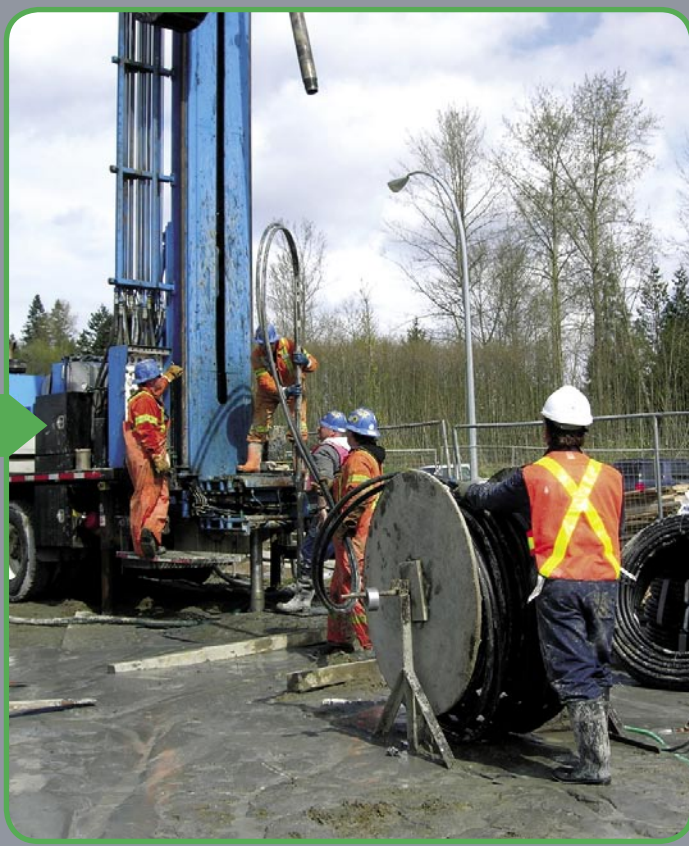
Lowering of geo loop