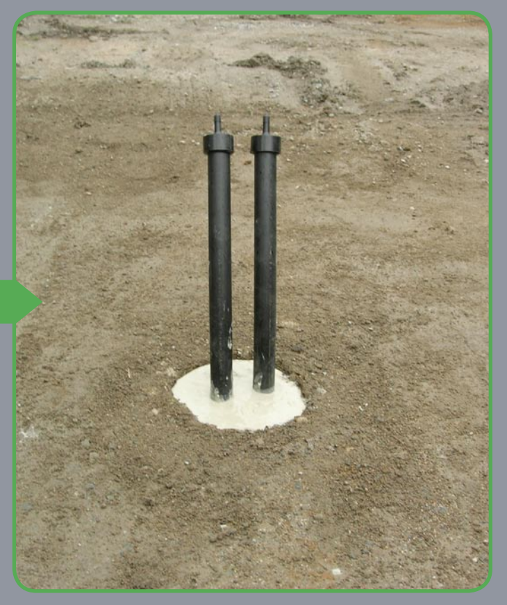
Completed geo loop installation